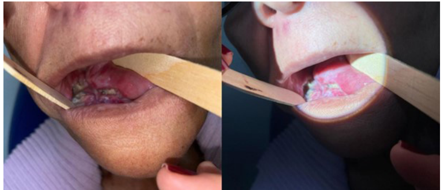
Figure 1. Photograph of the oral examination showing a granulomatous and vegetating lesion in the lower right alveolar ridge region.