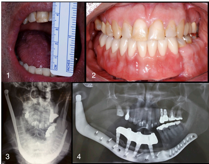
Figure 3. 1 - Oral opening (35 mm) with no joint deviation. 2 - Final occlusion with implant-supported prosthesis. 3 - Postoperative radiography: adequate condylar symmetry. 4 - Panoramic radiography: after six months of follow-up.