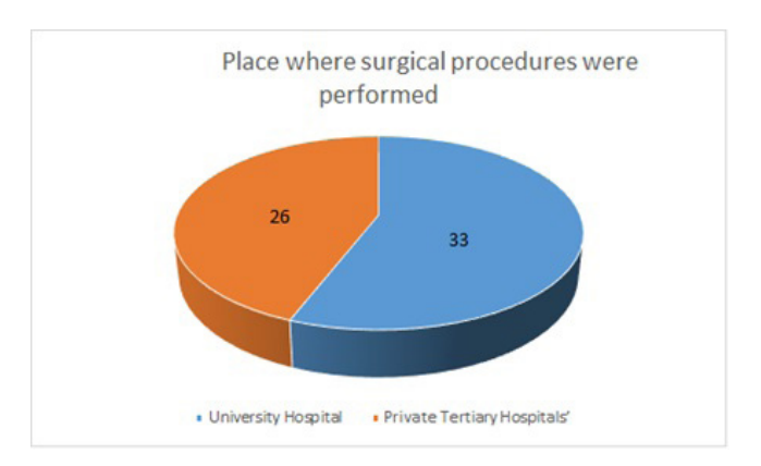
Figure 1. Place where surgical procedures were performed.'

Hypoparathyroidism was the most common complication observed in this series. Adverse events (AE), such as the need for postoperative tracheostomy and vocal fold paralysis (VFP), were also reported.