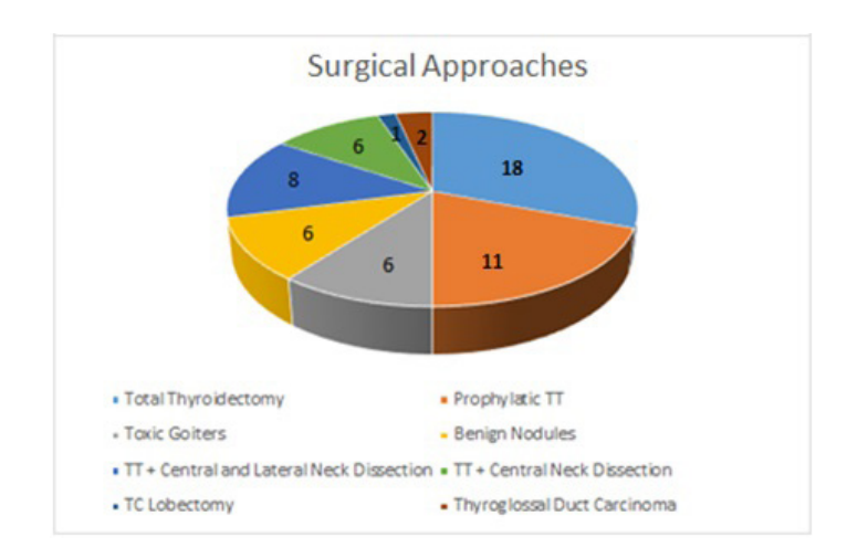
Figure 2. Surgical Approaches.