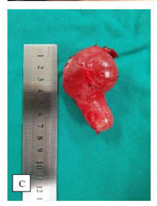
Figure 1. A - Computed Tomography showing right combined laryngocele; B- Resected laryngocele, with preservation of the delimitation of the surgical; C - Surgical specimen of laryngocele with dimensions of 7.5 x 5 cm.